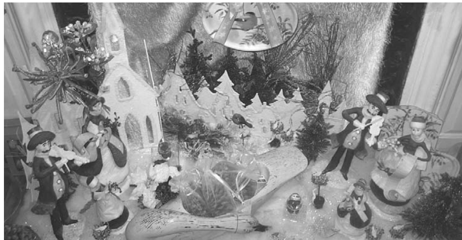
Some of the crafts available at Paper Reeds.

Another room in the house holds a large selection of children's items which all relate to nature and enjoying the simplicity of the outdoors. Exposing children to nature and the diversity that revolves around it is something the Stollers wanted to demonstrate in the store. Also multiple gardening tools, along with handcrafted pottery are displayed in this area as well. Isabel Blume is another line that's carried by Paper Reeds. They are natural stone